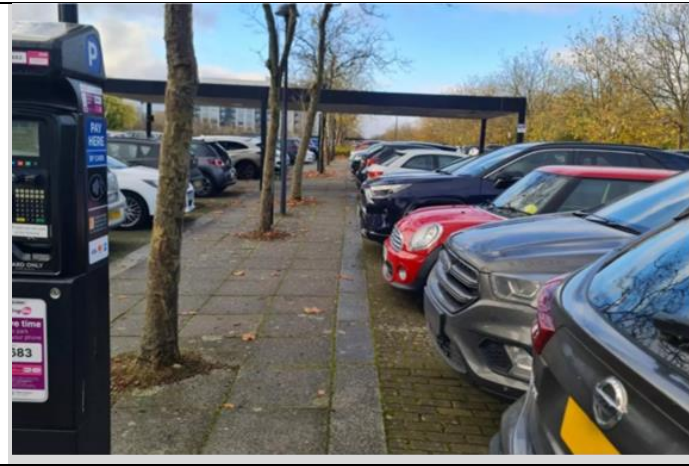
Parking tariff increases

https://www.milton-keynes.gov.uk/news/2024/drone-mapping-begin-milton-keynes