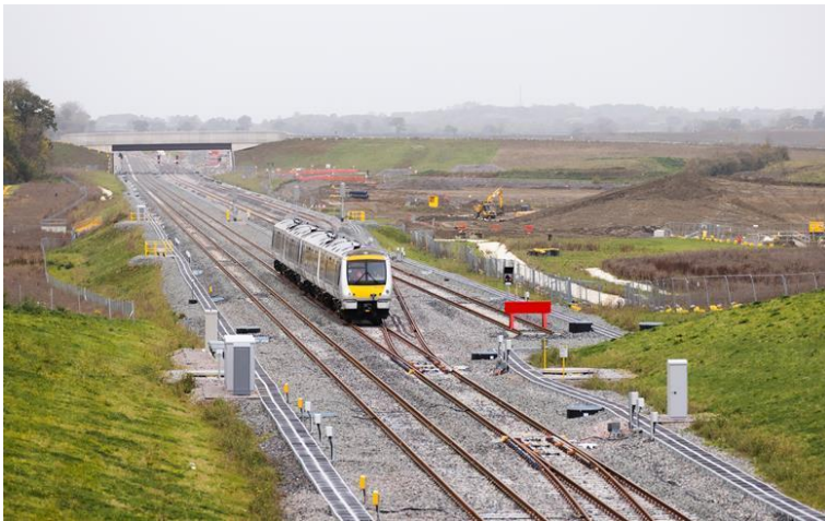
Modern Railways (11/24) Reports

The railway, which will connect Oxford to Cambridge via new stations at Cambourne and Tempsford, near St Neots, is intended to form a crucial link to boost the Oxford-Cambridge Regional Link.