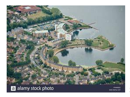
SEMK and Caldecotte South Consultation

The latest SEMK Stakeholder meeting has been informed that work on development frameworks for SEMK, South Caldecotte and Caldecotte C are being paused, with the Expressway being the reason for the delay. We are asking for an official statement, but from what was said we can deduce that if the Expressway comes anywhere near our little corner, then MKC will wait untl the route consultation is concluded. This is apparently autumn 2020 on the current programme. Of course if this autumn's announcement reveals that it's going elsewhere, then it will be all hands to the pumps again!