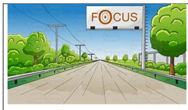
East West Rail - Timeline