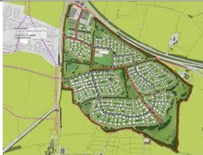
Levante Gate (in Little Brickhill Parish

1,250 dwellings and South of Bow Brickhill 1,300 dwellings) remain in the plan and will now almost certainly be included in the report that passes before the Planning Inspector in the Spring of 2026 for final approval)