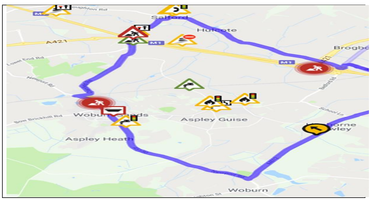
Cranfield Road, Wavendon (Road Closure)

Please note that the above road will be closed from 13th May 2019 for a year. This is to enable the bridge to be taken down and reconstructed due to the dual carriageway works of the A421. Diversion map above.