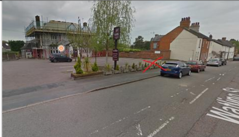
Street Light on Watling Street

Ward Councillors briefings will be held prior to go-live to update on the new contract and I will pass on that information as soon as it is to hand.