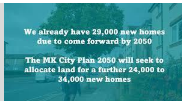
The MK Local Plan (MK2050)

Our Streetlighting team will be installing a new streetlight on this road later in the year. The new column will go roughly where the cross is on the image below.